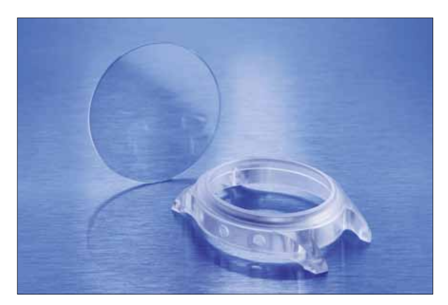
Fig. 2 PERLUCOR transparent ceramics brings new ideas to the design of jewellery

Alongside its high transparency, PERLUCOR also offers convincing performance thanks to its tremendous compressive strength, hardness and thermal resistance, which are over three to four times that of glass. This property is what makes the material so scratchresistant. Thus, transparent ceramics from CeramTec are well suited for use in extreme wear conditions, such as in mechanical, plant or equipment engineering. Blasting cubicles are a specific application example here. PERLUCOR delivers a clear view even when other viewports have long grown dull. PERLUCOR can be used at temperatures of up to 1400 °C - for example as an inspection window in high-temperature furnaces. Due to its purity, PERLUCOR also exhibits uniquely high chemical resistance and is thus of interest in fields of application with highly concentrated acids and lyes - whether as a plane surface for inspection windows or as a sight glass in tube geometry.