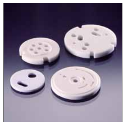
Fig. 3 Ceramic gaskets

Rauschert uses various aluminas with purities from 95 to 99,7 % depending on the customer application and requirements. These materials comply with different drinking water regulations including cer-