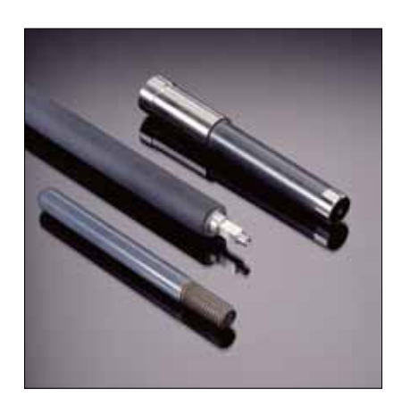
Fig. 4 Ceramic coatings

Ceramic valve components from Rauschert are used for industrial mixing plates including plumbing fittings and pneumatic valves used in industrial, medical and commercial applications. Rauschert manufactures ceramic gaskets by dry pressing, similar to the axial bearing seals. These gaskets control and regulate corrosive fluids in fittings and abrasive gas flows in pneumatic valves. The change to technical ceramics for this application increased the reliability and lowered the costs for service and repairs.