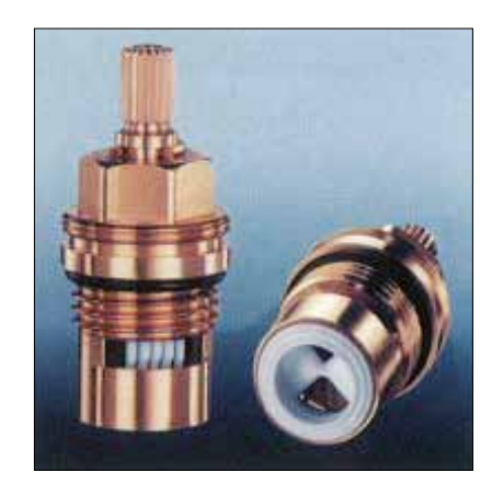
Fig. 2 Plumbing fittings