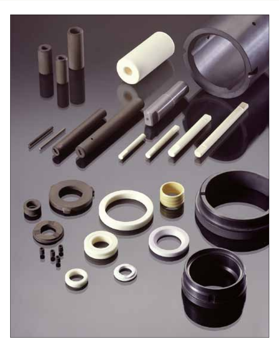
Fig. 1 Ceramic pump components

Technical ceramics are good solution for demanding pump and valve applications where conventional materials fail. Related to the individual application the choice of material, shape and surface finish has to be defined to meet demanding requirements.