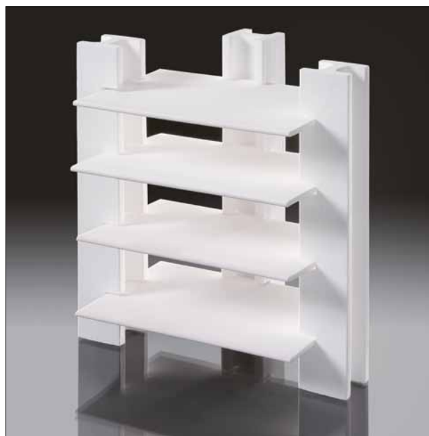
Fig. 8 RAKOR multi-platform racks for sintering smaller parts