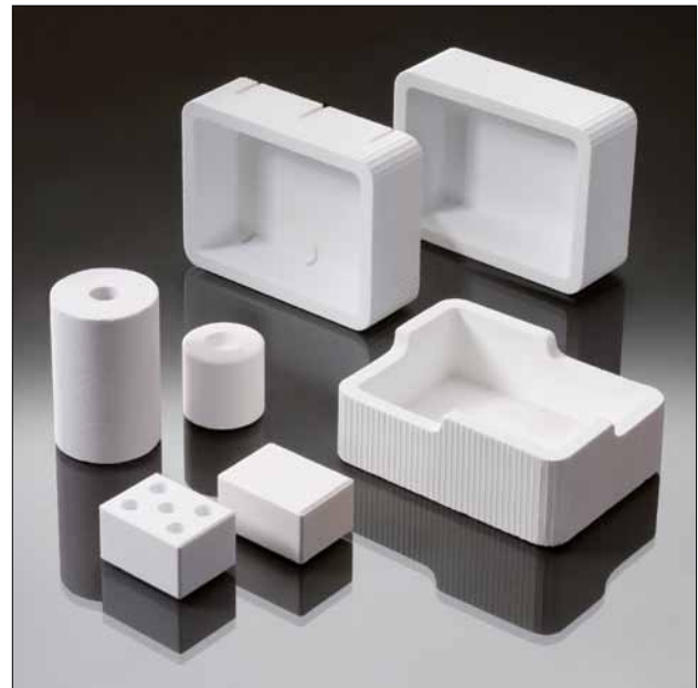
Fig. 2 RAKOR saggars and firing props