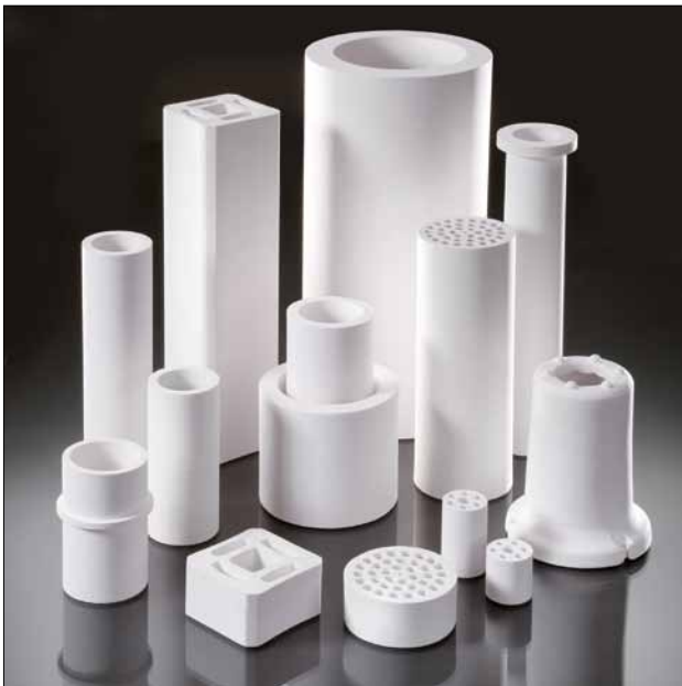
Fig. 1 Examples for RAMUL components

Alumina- and mullite-based materials for kiln furniture application of up to 1700 °C have been successfully developed. The materials show significantly improved thermomechanical properties in comparison to commercial benchmark products permitting the design of kiln furniture with reduced mass. This leads to significant energy savings in high temperature processes. It is demonstrated that the achieved improvement in corrosion resistance against lead-containing vapours increase the lifetime of the products considerably.