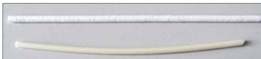
Fig. 6 Solid rods (diameter 3,3 mm) made out of RAMUL-HT (top) and a benchmark material (bottom) after five kiln cycles at a dwell temperature of 1600 °C