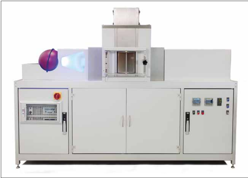
Fig. 3 Thermo-optical measuring (TOM) device TOM air used for measuring the uniaxial viscosity of the materials

total mass of the kiln charge. This leads to long process cycles, large energy consumption and an irregular energy input into the products. To reduce the mass of the kiln furniture, two strategies are followed: a design approach and a material approach. The first approach is to optimise the design of the kiln furniture, e.g. thinner walls, combination of different materials, etc. [7]. The design approach is often limited by the high temperature performance of the materials used for the kiln furniture [8]. Thus, the second approach is to improve the materials for the kiln furniture, especially their high temperature properties [9].