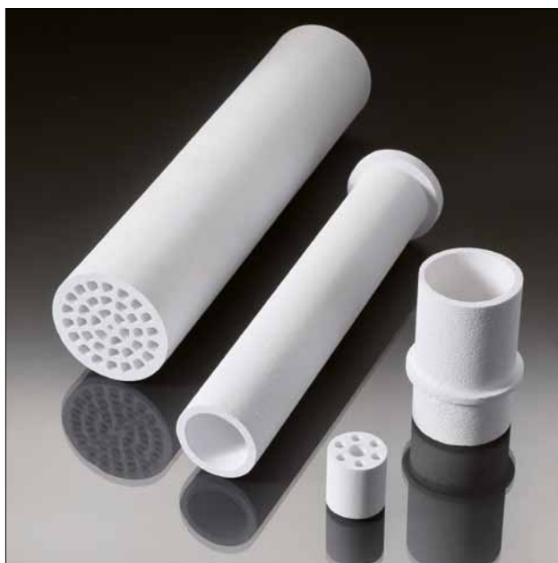
Fig. 7 Kiln components like exhaust collar pipes and firing props

Fig. 1 shows various examples of RAMUL and RAMUL-HT products like thin- and thick-walled pipes, square, round and multihole tubes and also collar pipes,