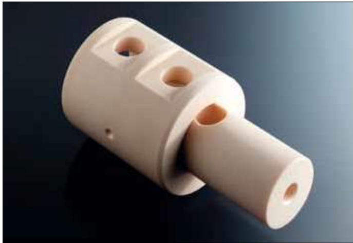
Fig. 2 Dosing unit as demonstration model