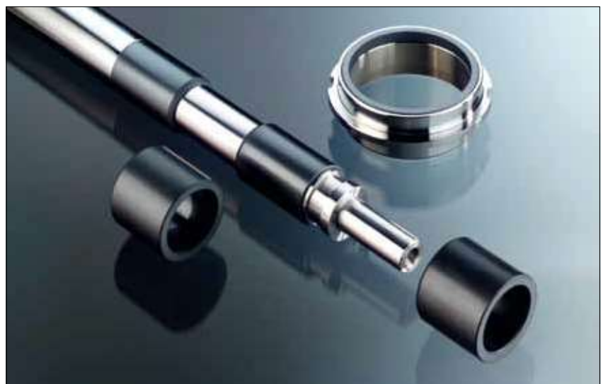
Fig. 4 SiC shaft with SiC bearing

Thanks to the manufacturing structure and flat hierarchies, the company can respond very flexibly and quickly to customer requests. True to the motto "Technical ceramics – opportunities and solutions connect us", the Albershausen-based company has specialized in supporting customers with regard to material issues and ceramic-compatible design. Every customer requirement is realized individually. Every customer receives