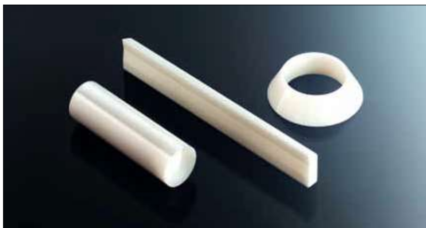
Fig. 6 CR105 cutting ceramics

Maximum precision is a guarantee for the high quality of the company's technical ceramic products. The comprehensive material know-how coupled with extensive experience in fabrication amassed in