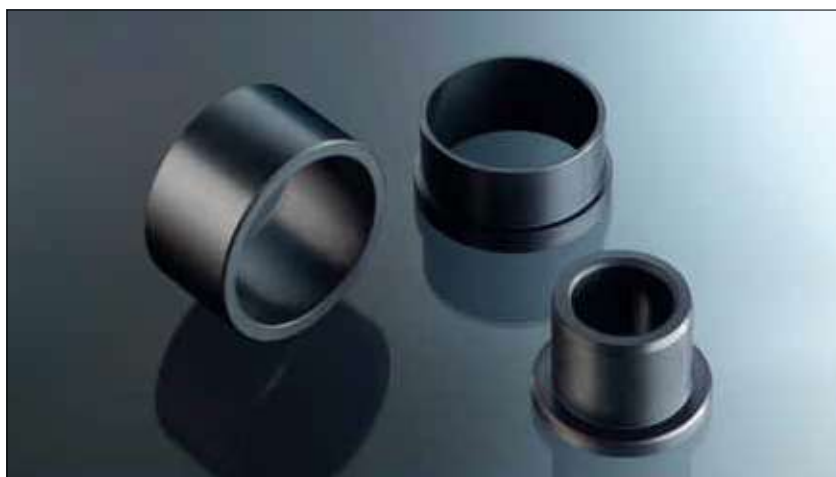
Fig. 5 SiC bearing for a pump used in the chemical industry